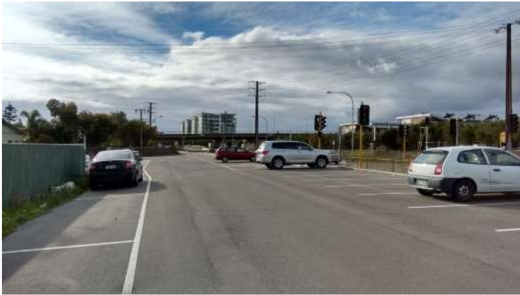
Photo 10. Three isolated apartment blocks on the eastern side of the station. The large amount of empty land to the north is part of a failed urban redevelopment.

The Port River is just behind these buildings.