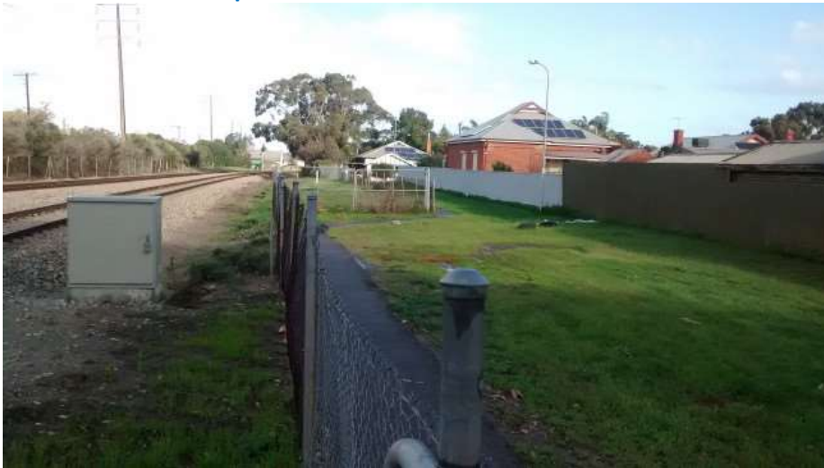
Photo 6. Car park