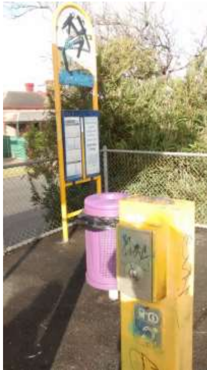
Photo 2. East platform