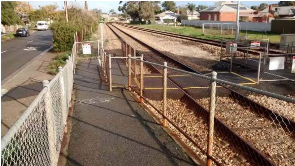
Photo 10. Wheelchair ramp