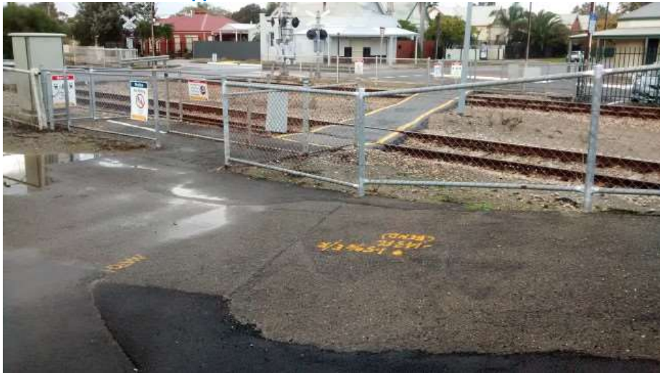
Photo 9. South ramp