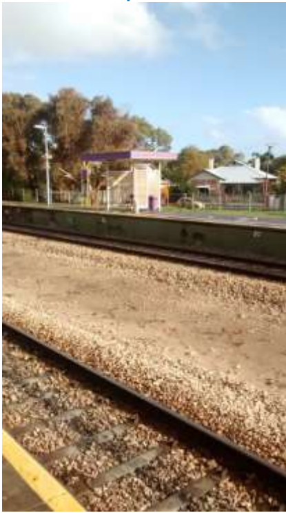
Photo 3. Graffiti