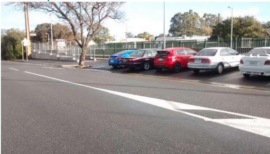
Photo 7. North East ramp